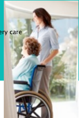
Post surgery care